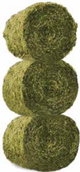
Intrepid Trio provides three essential minerals readily available as your crop needs them.

Magnesium serves as a central component of the chlorophyll molecule, aiding the plant in photosynthesis. Cations such as calcium and potassium compete with magnesium for plant uptake, therefore applying a balanced fertilizer like Intrepid Trio is a key for promoting balanced fertility.